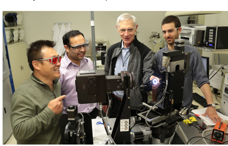
Mechanical Technology Inc., Albany: Metrology Lab